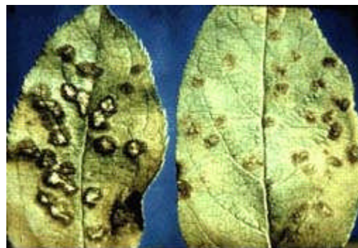
Apple scab lesions on apple leaves.

Symptoms first appear in the spring as spots (lesions) on the lower leaf surface, the side first exposed to fungal spores as buds open. At first, the lesions are usually small, velvety, olive green in color, and have unclear margins. On some crabapples, infections may be reddish in color. As they age, the infections become darker and more distinct in outline. Lesions may appear more numerous closer to the mid-vein of the leaf. If heavily infected, the leaf becomes distorted and