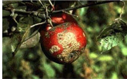
Apple scab lesions on fruit.

Apple scab is caused by the fungus, Venturia inaequalis . It survives the winter in the previous year's diseased leaves that have fallen under the tree. In the spring, the fungus in old diseased leaves produces millions of spores. These spores are released into the air during rain periods in April, May and June. They are then carried by the wind to young leaves, flower parts and fruits. Once in contact with susceptible tissue, the spore germinates in a film of water and the fungus penetrates into the plant. Depending upon weather conditions, symptoms (lesions) will show up in 9 to 17 days.